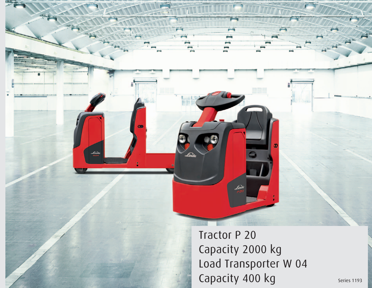
Tractor P 20 Capacity 2000 kg Load Transporter W 04 Capacity 400 kg